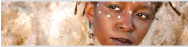
Chiwoniso • Dec 4, 2009