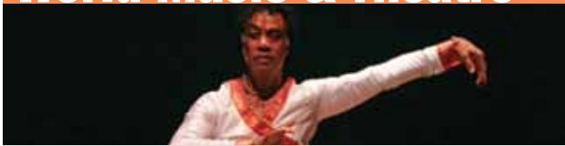
Chitresh Das Dance Company • Oct 17, 2009