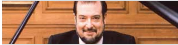
Garrick Ohlsson • Jan 13, 2010 & Feb 9, 2010