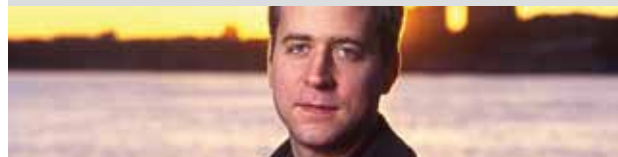
Jeremy Denk • Mar 31, 2010