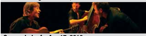
Samarabalouf • Apr 17, 2010